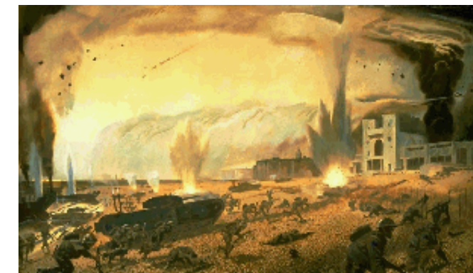
Dieppe Raid by, Charles Fraser Comfort

in Windsor, Essex and Kent County. Our communities lost husbands, fathers, sons, brothers, cousins, nephews, neighbors, school mates, work mates and friends. Dieppe became a rallying point for all residents of south-western Ontario. The Regiment was reborn, rebuilt and returned to be a key contributor in the major battles that followed the Normandy landings two years later, until final Victory in May of 1945.