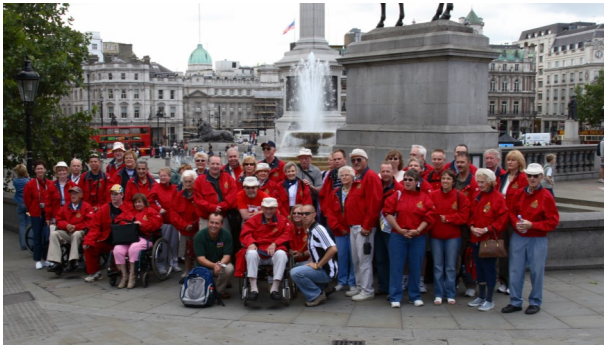
Our Veterans, Family and Friends of the Regiment touring prior to the Dedication Ceremony in Dieppe 2006